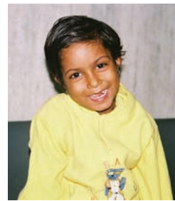
India girl after surgery.