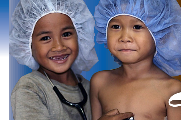
Cambodia mission