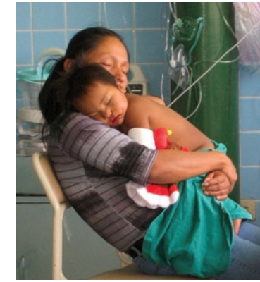
Child with mother after surgery in Ecuador.