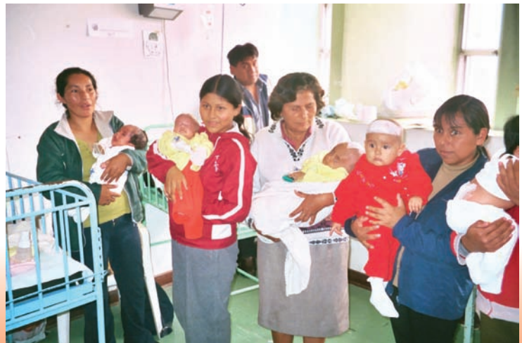
Grateful mothers with their children after surgery during Lifeline Neurosurgical Mission to Lima, Peru.