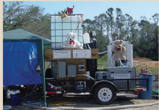
A mobile Living Water Treatment System™ combined with a Reverse Osmosis System in Pearlington, Mississippi, after Hurricane Katrina.