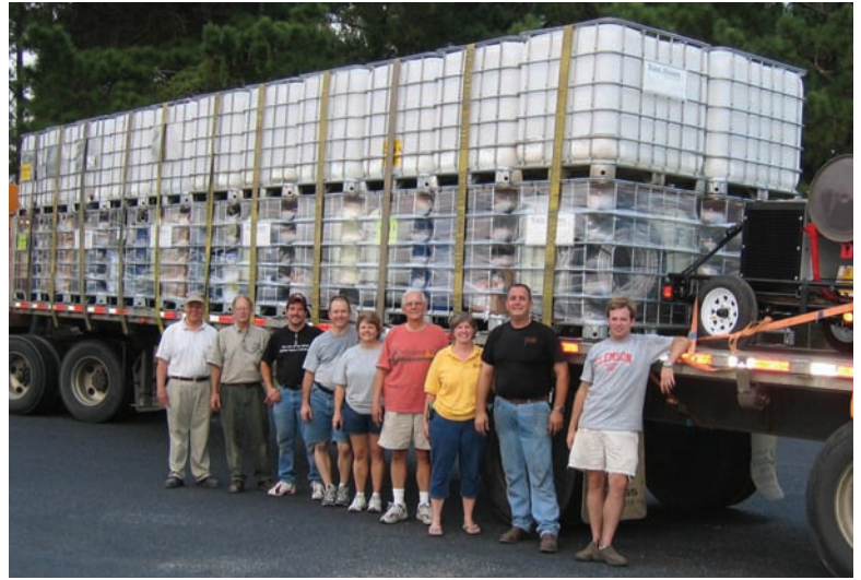
Ten Living Water Treatment Systems™ being sent to the Gulf Coast.

and to the donors of the Tsunami Relief Fund whose participation is being applied to the support of the Katrina Relief Fund.