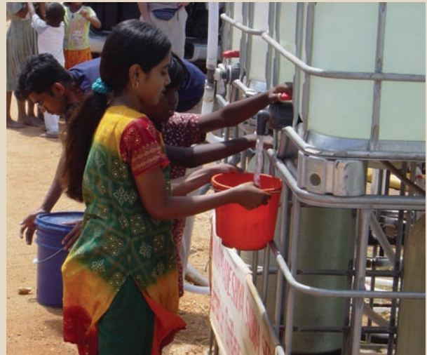
Young girl gets water from one of the installed Living Water Treatment Systems™ in Kinniya, Sri Lanka.