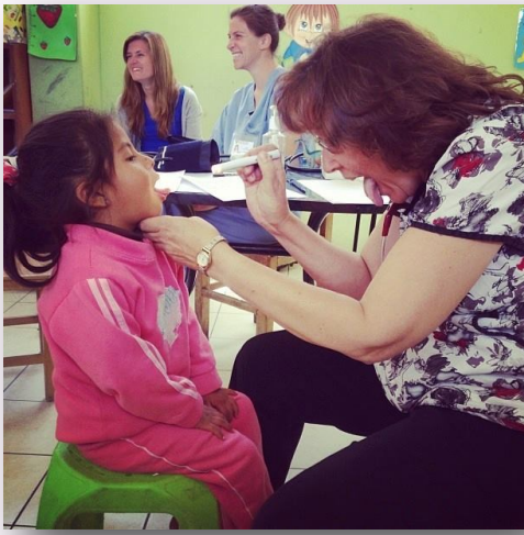
Peru Mission 2013