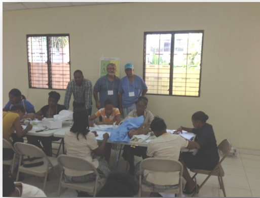
Neonatal course in Haiti