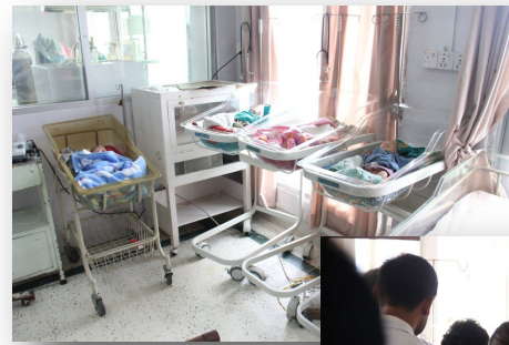
Nepal Mission 2013